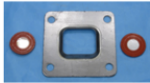
Closed Seal Rings